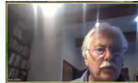
2021 Ken Miles