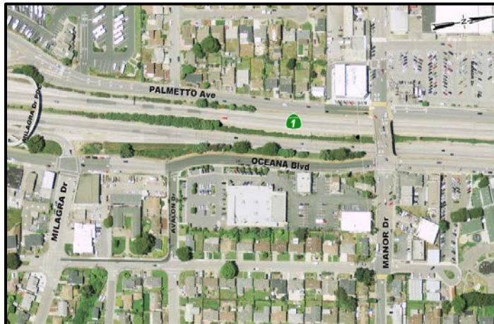
Project Location Map